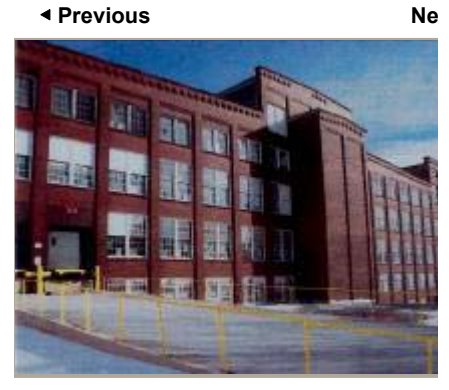
Click here to view larger image

Former manufacturing building located in Wadsworth, OH